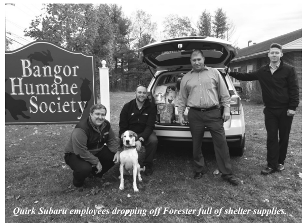
Quirk Subaru employees dropping off Forester full of shelter supplies.

Thank you to every single one of you who adopted this October, helped Fill the Forester and participated in the #SNELOvesPets campaign.