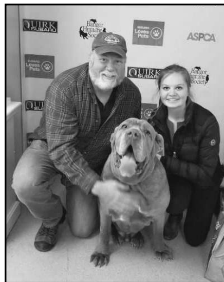
Tonka, the Neapolitan Mastiff, found his forever home with a family who spoils all 162 pounds of him!