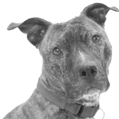
After Stewie's owner passed away and residing at BHS for months, he found love again with a new family who gave him the time he needed to bond with his new people.