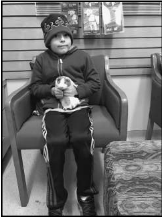
Harry the guinea pig finds his new friend!

Founded in 1869, this year the Bangor Humane Society celebrates its 150th Anniversary! That’s 150 years of granting second chances to homeless pets and enriching the lives of the people in our community through pet adoption. We celebrate 150 years of YOU – our adopters! Without you, our mission would be meaningless and our life-saving goals would be futile. Thank you for 150 years of believing in second chances and opening your hearts and homes to one of our animals in need!