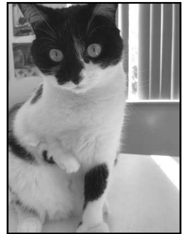
NyNy, formerly Footloose, found an adopter who embraced her physical deformity; she continues to show her gratitude by serving as a service cat, alerting her new person of various medical crises.