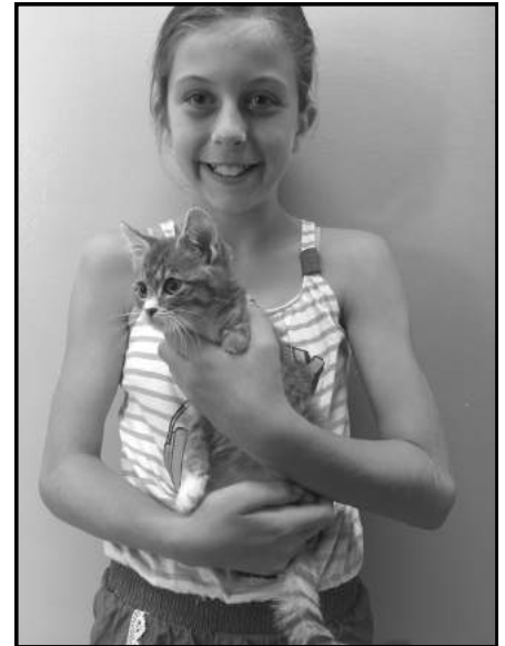
A young adopter smitten with her new kitten!