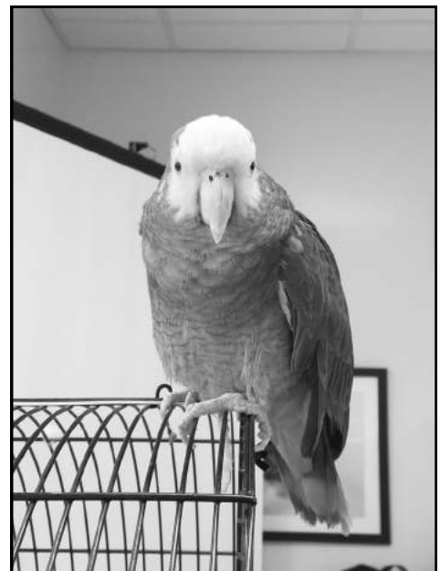
Percy, an under socialized African Parrot, was rescued from a pet hoarding situation and found a second chance with an experienced new owner.