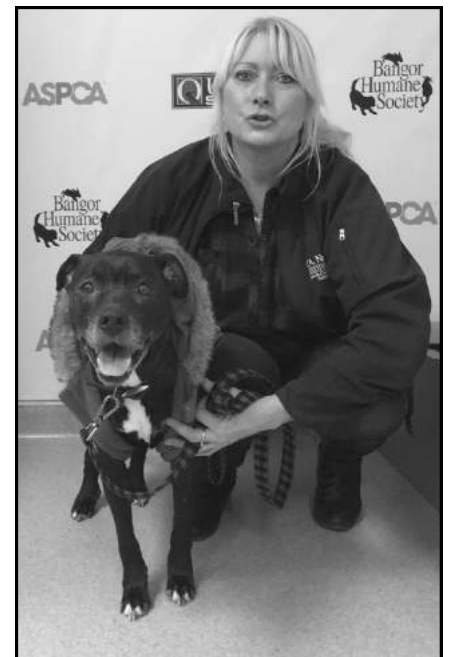
One of our senior pups, Cindy Lou, with her new dog mom!