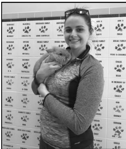
One of our bunnies hops happily into the arms of a new adopter!