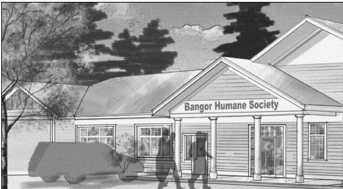
Architect rendering of the renovated BHS